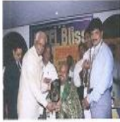
Life time achievement Award: Junior Chamber, Tirupati - Honoured by the Hon'ble Member of Parliament, Tirupati, Sri.N.Venkataswamy I.A.S. (Retd.)- 2001.